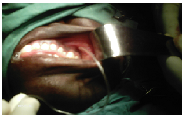
Figure 2. Indwelling nasogastric tube in the parotid duct