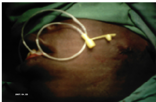
Figure 3. Indwelling nasogastric tube with fistula closure

Post-operatively patient was managed with clindamycin caps 150mg every eight hours for five days and metronidazole tabs 400mg every eight hours for five days. I.M. penatocine 30mg stat and tabs paracetamol two twelve hourly for three days. He was discharged 10 days post operatively with an in-dwelling nasogastric tube which was removed one month post-operatively following