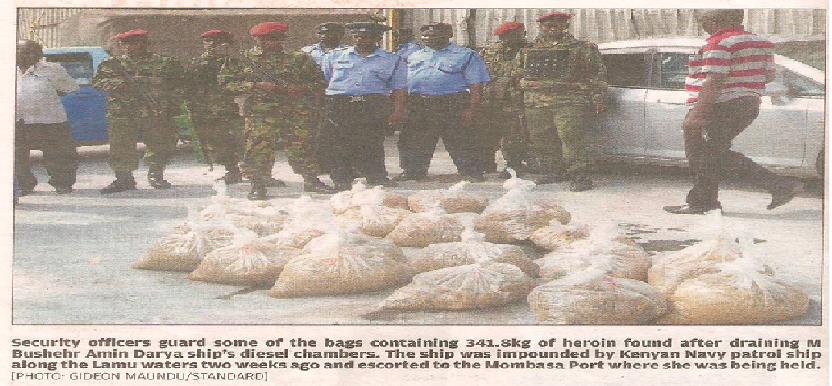
Plate 2: Security officer guards bags containg 341.8kg heroin.

Explosion was a controlled detonation to destroy 370.8kg of heroin and the stateless ship impounded last month