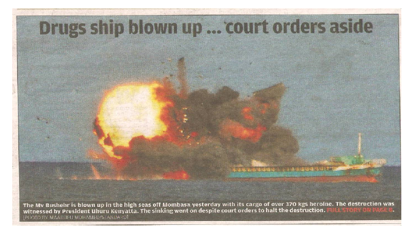
Plate 1: Showing destruction of 370 kgs heroin.

Explosion was a controlled detonation to destroy 370.8kg of heroin and the stateless ship impounded last month