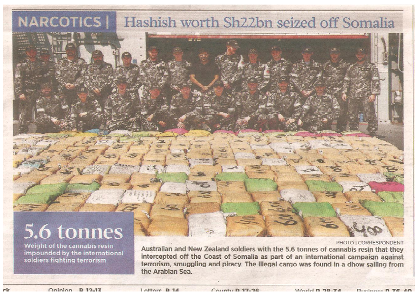
Plate 3: Showing Intercepted 5.6 tonnes of cannabis of the coast of Somalia by Australian and New Zealand soldiers

Plate 2: Security officer guards bags containg 341.8kg heroin.