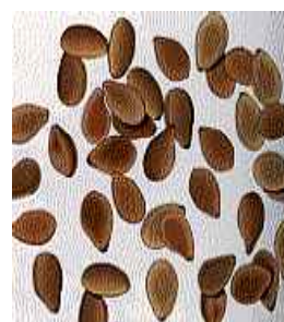
Figure 3: sesame seed

differences. Both whole and dehulled samples were moderately high in crude protein compared with other plant fruits, seeds and nuts (Nahar et al. , 1990, Hernandez-Perez et al. , 1994). Since vegetables and fruits are the major contributing sources of protein in the developing countries, the level of crude protein in sesame seed can qualify it as a good source of plant protein, if