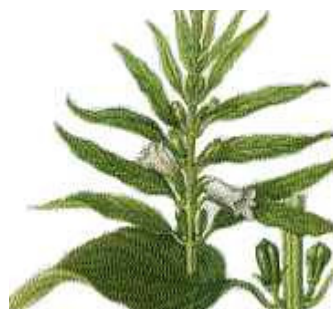
Figure 1: sesame plant