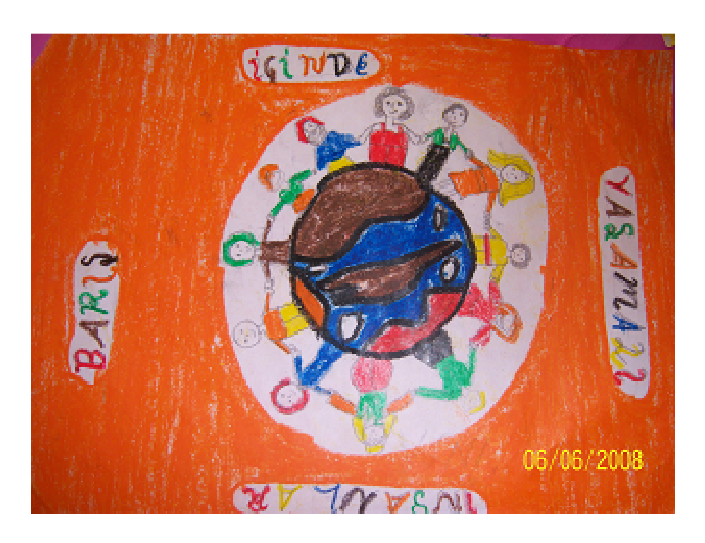
Figure 1. Male, 12, class:5