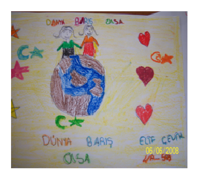
Figure 2. Female; 11 class:4

war, they drew the world in their pictures.