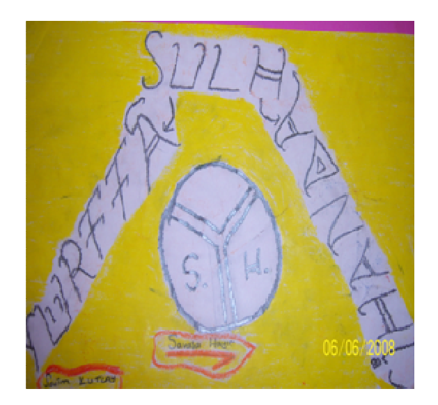
Figure 6. Male: 12 class:5