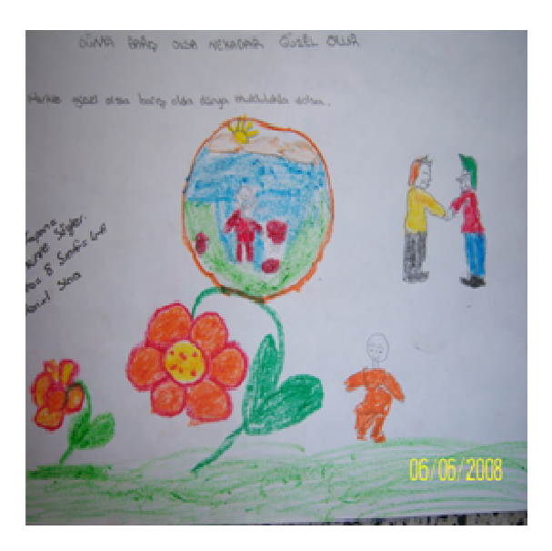
Figure 3. female:11:class;4