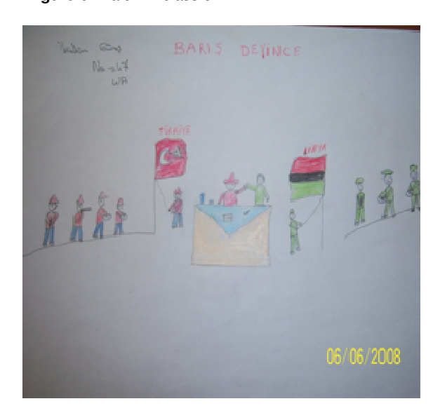
Figure 7. Male: 11: class:4