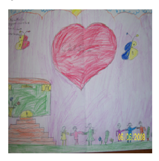
Figure 5. Female: 11 class:4