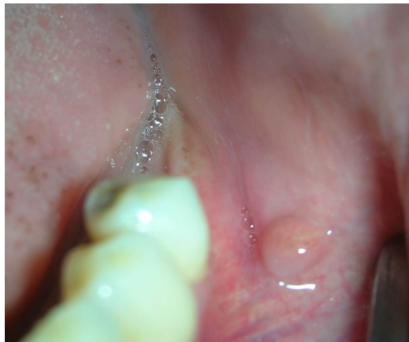
Figure 4. Mucocele on the left side buccal sulcus