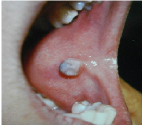
Figure 3. Mucocele on the left side of the buccal mucosa