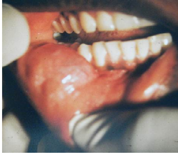
Figure 2. Mucocele on the right side of the lower lip