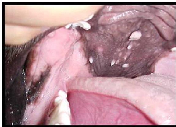
Figure 4. Recurrent papillomas lesions during the treatment on the palate.

[Veríssimo et al 2002] and papillomas were seen on the haired skin of the face, pinna and forelimbs [Nicholls et al 1999]. Analysis of material removed confirmed the presence of PV infection. The treatments of persistent papillomavirus infections are harder and induce to economic loss with excessive spending on drugs without therapeutic success. Cases of nonregressing canine papillomatosis have been reported after over 10 attempts included with autogenous vaccine and COPV L1 VLP vaccine [Nicholls et al 1999].