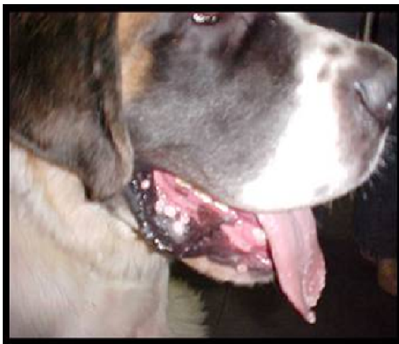
Figure 2. Small oral papillomas on the tongue and around of the oral cavity from dog.