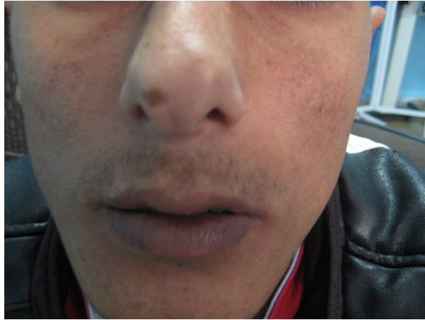
Figure 1. The patient with Addison disease had facial hyperpigmentation.