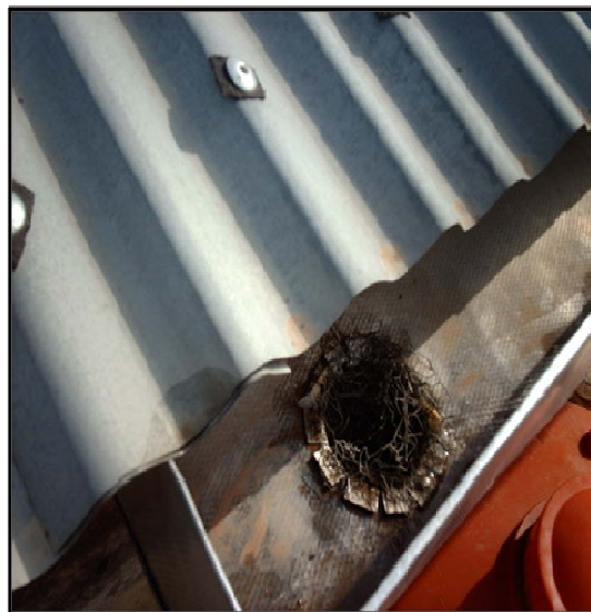
Plate 2: Gutter with Mesh