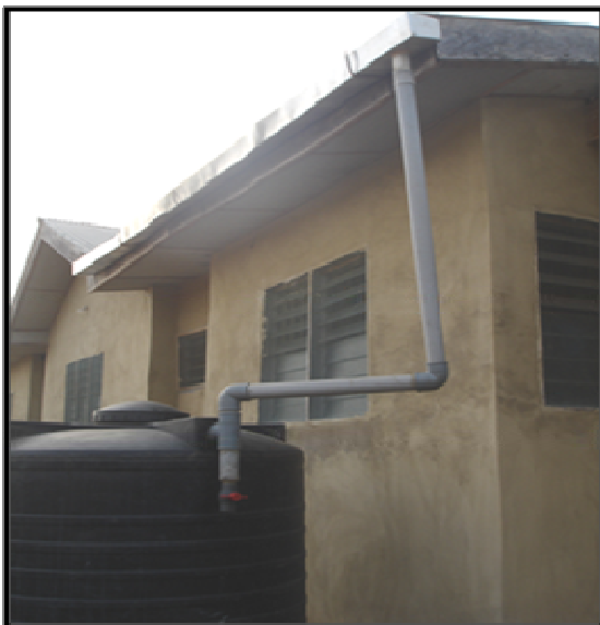
Plate 1: Tank with Pipe