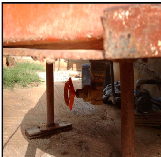
Plate 4: Tank Support with Valve

will augment the shortage. Rationing and economic use of water at the peak of the dry season should also be strictly observed. A large underground reservoir could be constructed if there is available land space to accommodate the harvesting of the entire roof area. This would provide the required water for the household throughout the dry period, thereby arresting the perennial water shortage at household level as commonly experienced in Ibadan city.