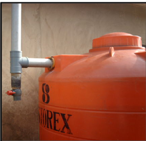
Plate 3: Tank with Pipe and Tap