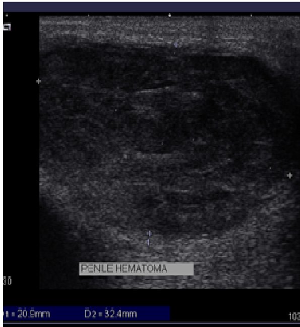
Figure 1 Hematoma in the Left Corpus Cavernosum