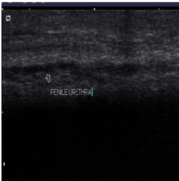
Figure 3. Penile Urethra and Corpus Spongiosum appear intact

Doppler interrogation revealed significant disruption of cavernosal blood supply in the affected region (Figure 2). Scanning over the glans penis, corpus spongiosum and urethra were unremarkable (Figure 3). Ultrasound diagnosis of a left corpus cavernosal hematoma with associated arterial compromise was made. Immediate treatment including conservative and/or surgical