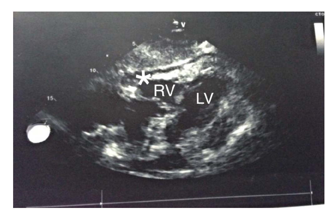
Figure 3. Short-axis modified view on two-dimensional echocardiography, revealing pericardial effusion as 2.2 cm echo-free space with thickened pericardium (asterix) and right ventricle collapse.