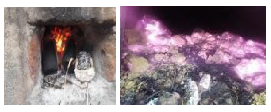
Figure 2. Burning of briquettes during fish processing process of fish products.