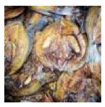
Figure 4. Fish Smoked products.

Means with same superscripts in a row are not significantly different (P>0.05)