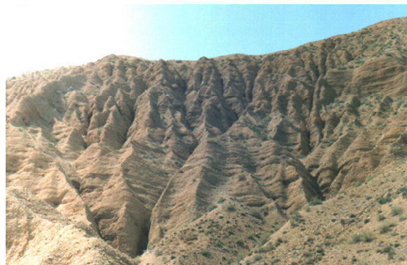
Figure 3. Hezardarreh Formation, East of Tehran, Iran.

sedimentation. The layers of this Formation have horizontal aspect and have not supported by tectonic movements. Tehran alluvium Formation overlaying Kahrizak Formation and has been covered by Holocene alluvium. These alluvium sediments have been formed due to erosion and resedimentation of Kahrizak Formation.