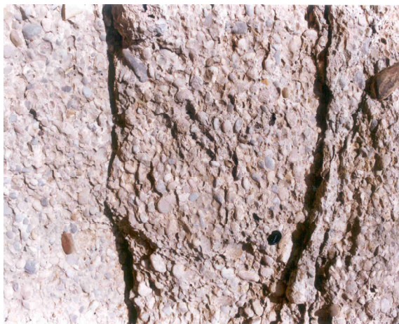
Figure 5. Bakhtyari Formation, Fars region

sandstone and siltstone layers and lenses Figures 4 and 5.