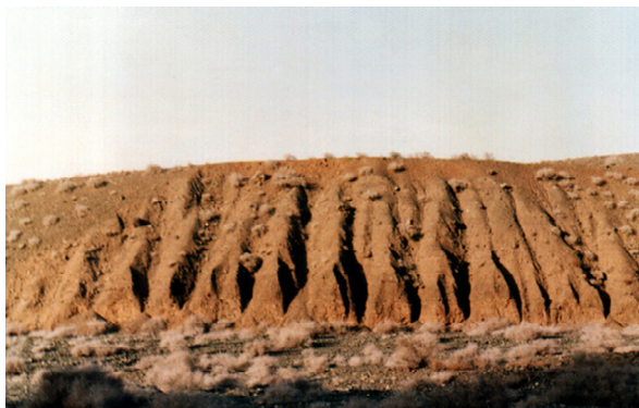
Figure 2. Hezardarreh Formation, Tehran regione.