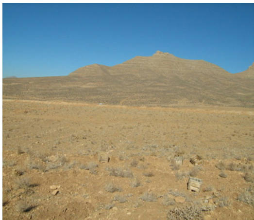
Figure 4. Bakhtyari Formation, Fars region